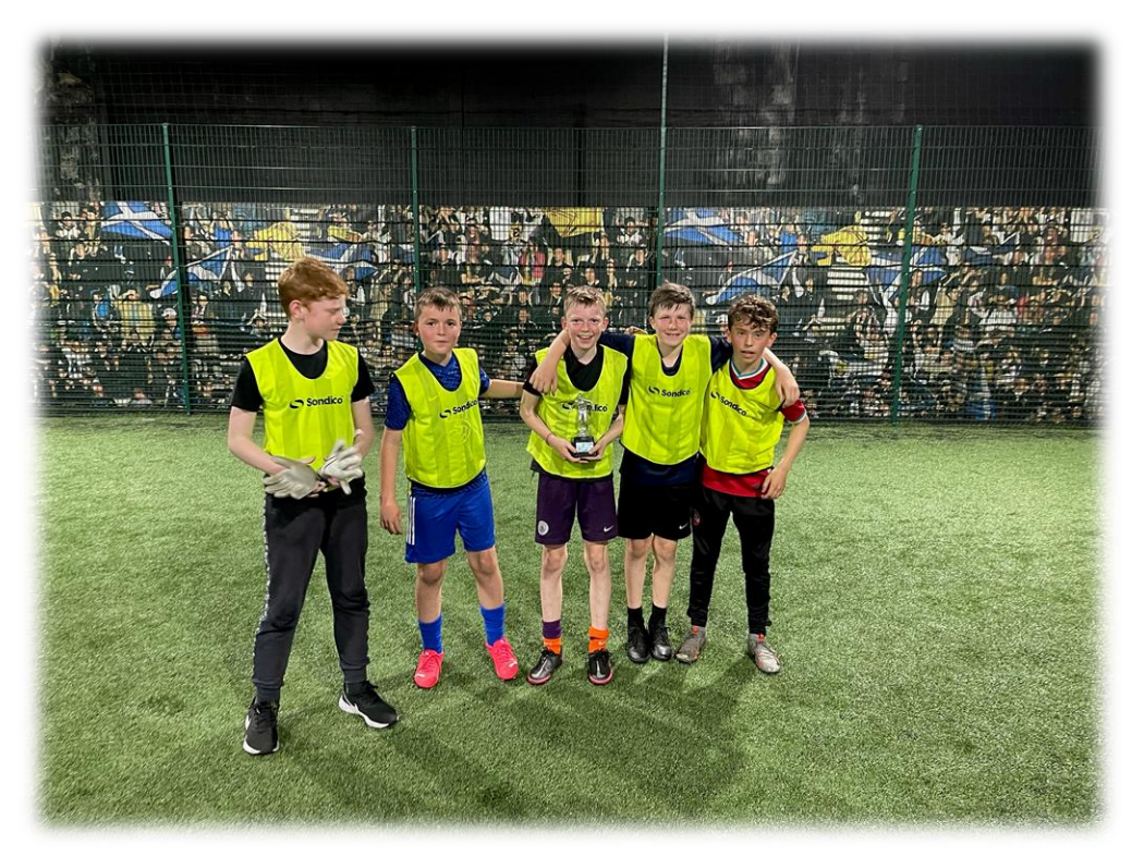
86th Glasgow Company Section - S2-S3. Winners of the first District 5-a-sides held on 11/09/2021 at The Pitches, Pollokshaws.