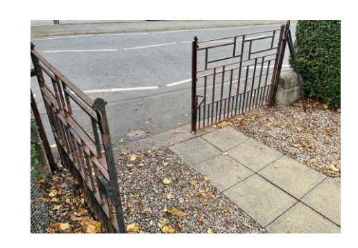
Work in progress includes: Removing rust from the gates at the driveway and Rosslea